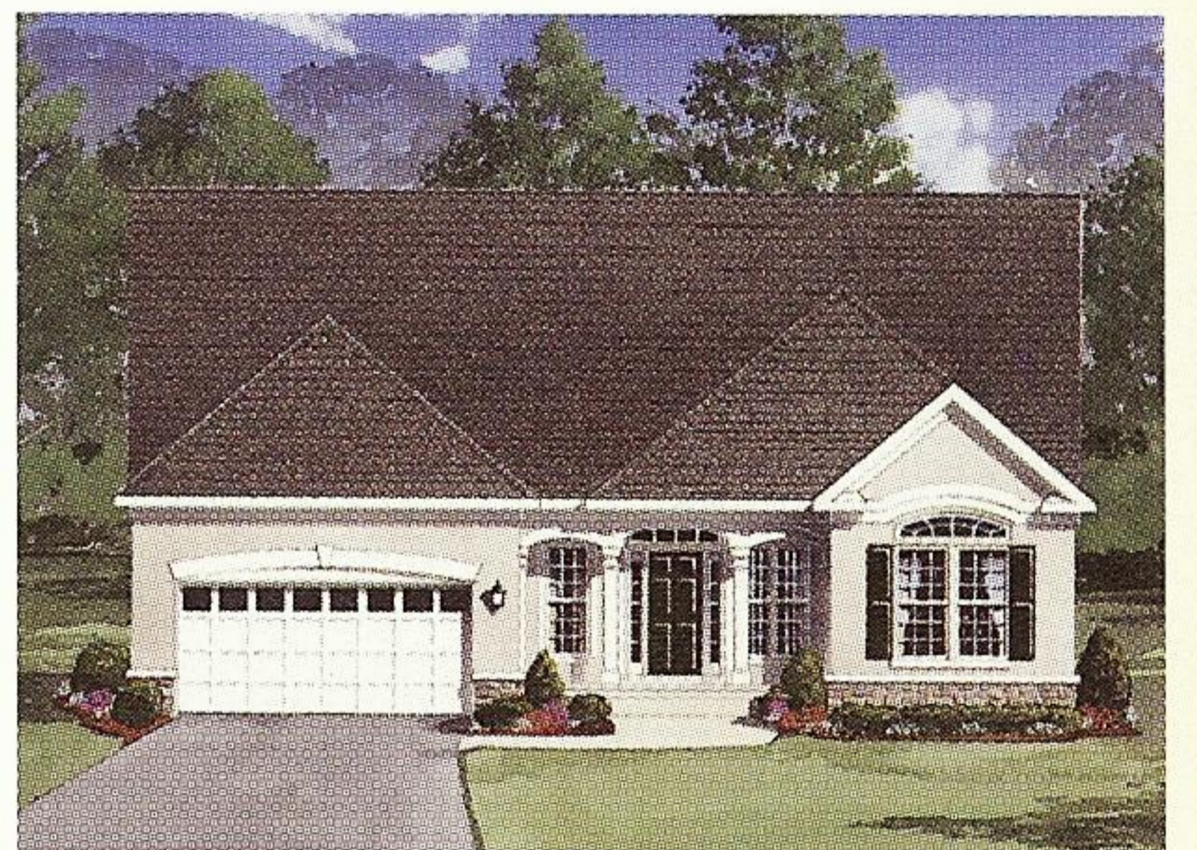
Elev. C - shown with optional stone/stucco finish