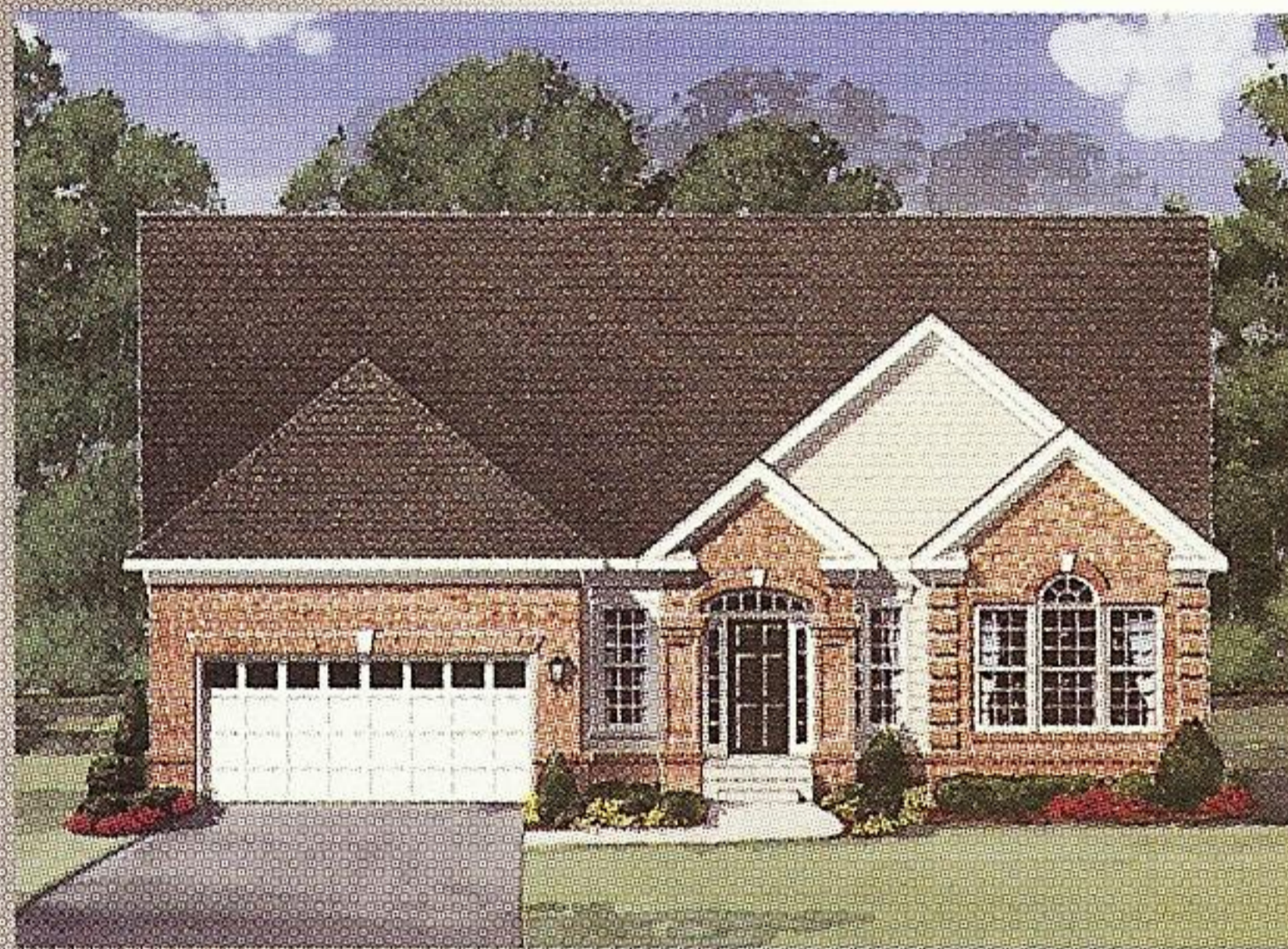
Elev. B - shown with optional full brick finish