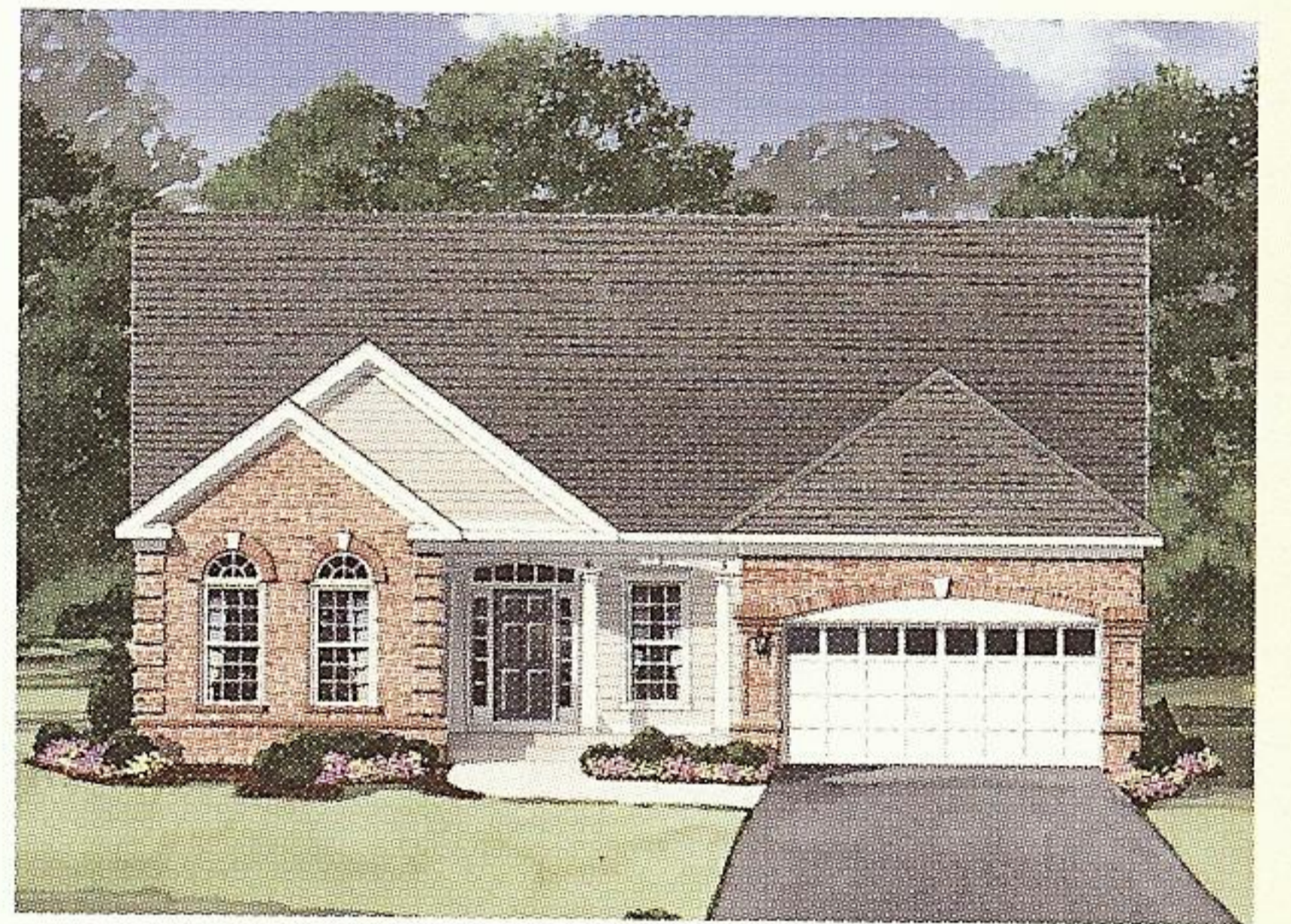
Elev. C - shown with optional full brick finish