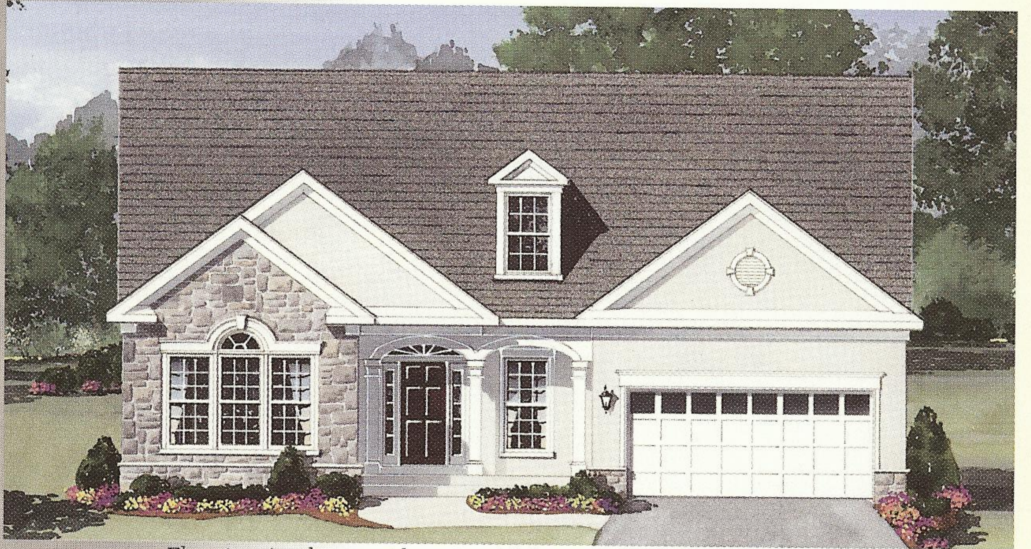
Elevation A - shown with optional full stone/stucco finish and dormer