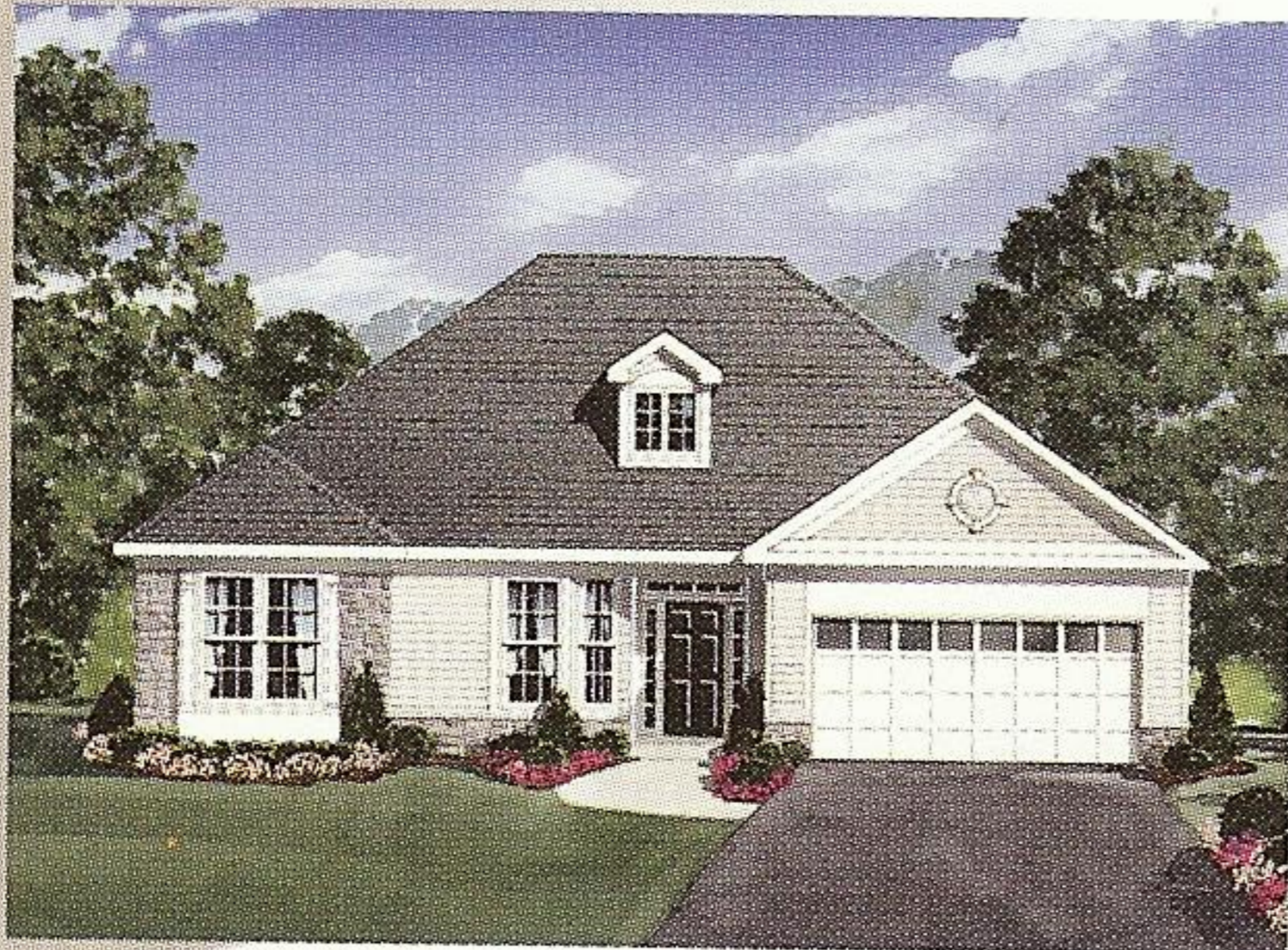
Elev. B - shown with optional full stone finish