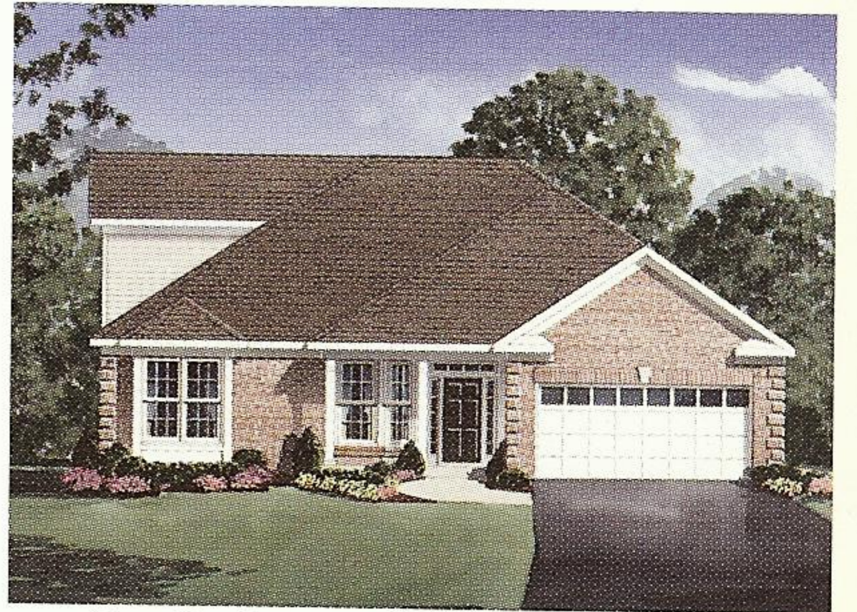
Elev. C - shown with optional brick finish and optional second floor