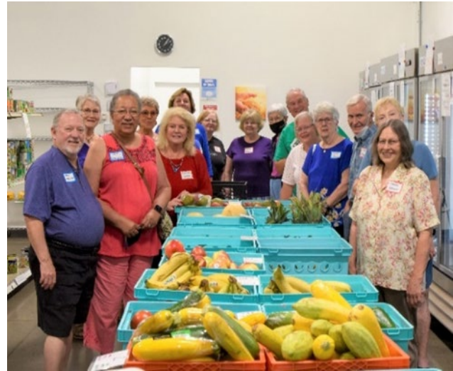
Members on-site at the Haymarket Regional Food Pantry