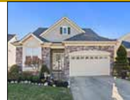
6143 Beton Ct $800,000