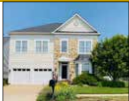
13000 Triple Crown Lp $779,900