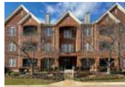
13890 Chelmsford Dr #204 Rented $2,600 p/m (Tenant Agent)