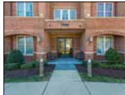
7065 Heritage Hunt Dr #109 $2,350 p/m