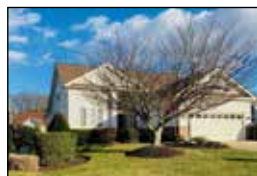
6727 Kimberwick Ct $650,000