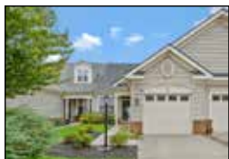
13511 Norwick Pl $515,000