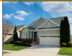
6869 Tred Avon Pl $779,900