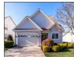
13867 Cinch Ln $540,000