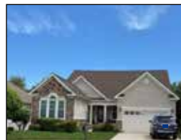
6705 Whirlaway Ct $780,000 (Buyer Agent)