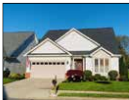
6200 Settlers Trail Pl $649,900