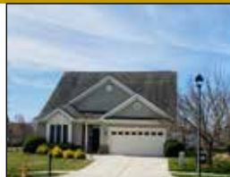
13586 Alta Vista Ct $702,400