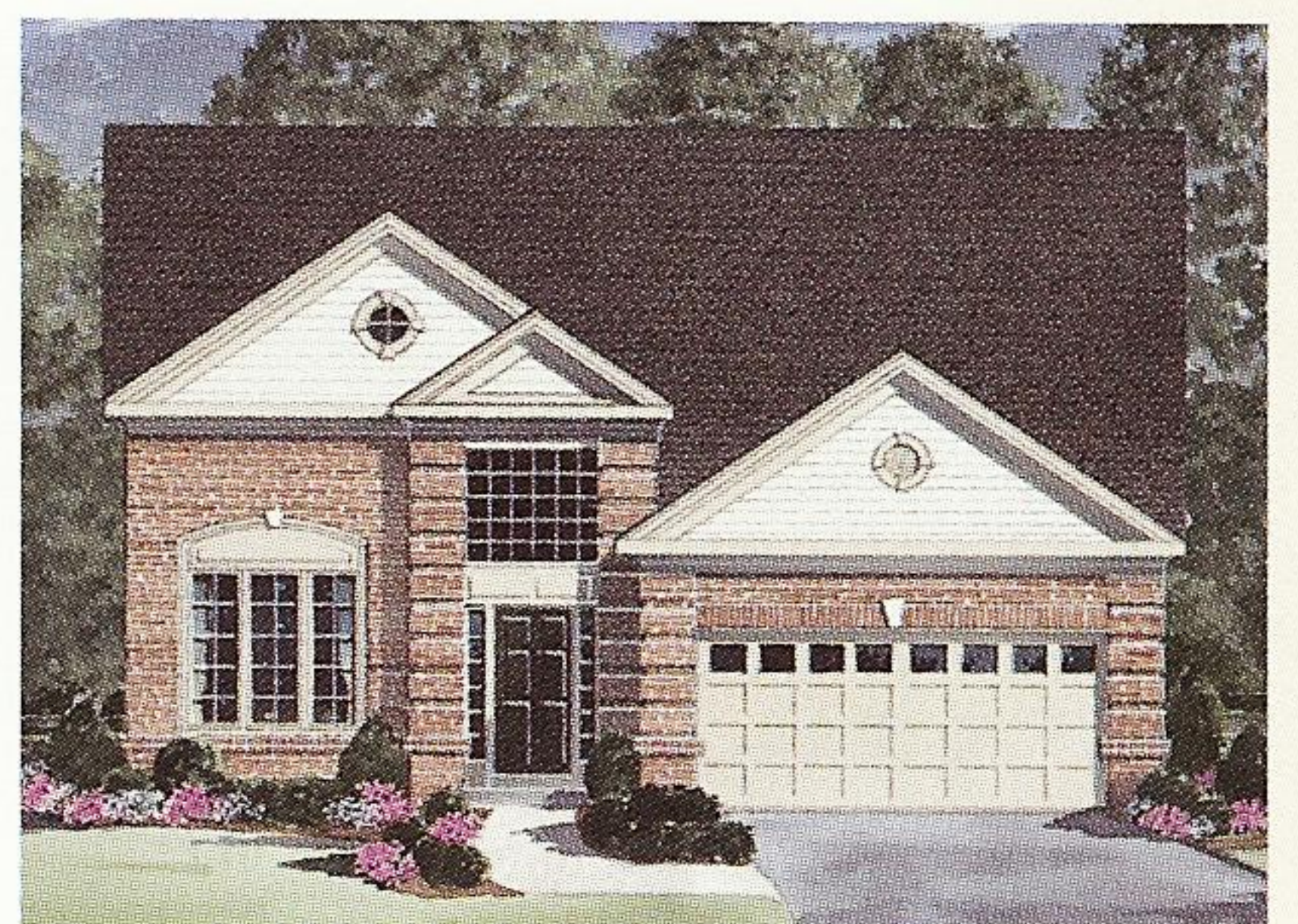
Elev. C - shown with optional full brick finish