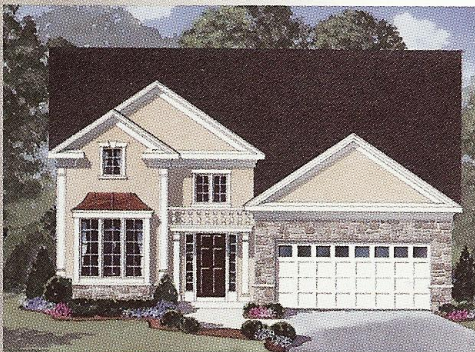
Elev. B - shown with optional full stone/stucco finish